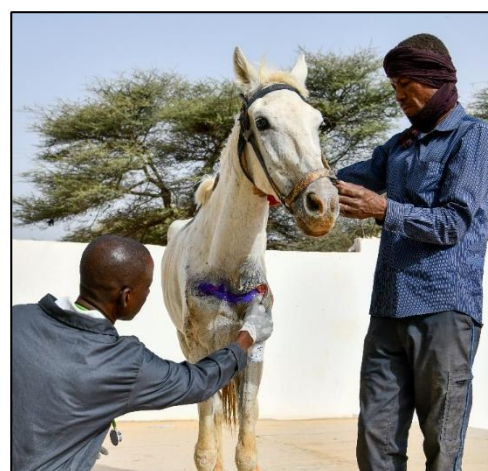
SPANA's vet treated Mahim and trained his owner in how to prevent future injuries

With your support we can run specialist community training workshops about harnessing and wound prevention. We must equip impoverished communities with the skills they need to stop this terrible cycle of suffering.