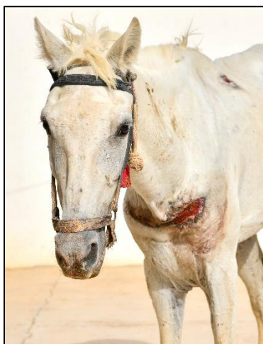
Mahim's chest was rubbed raw by his makeshift harness

Sadly, in developing countries where families often struggle to afford daily necessities, patching up their animal's harness with old rope or rusty wire can seem like their only option.