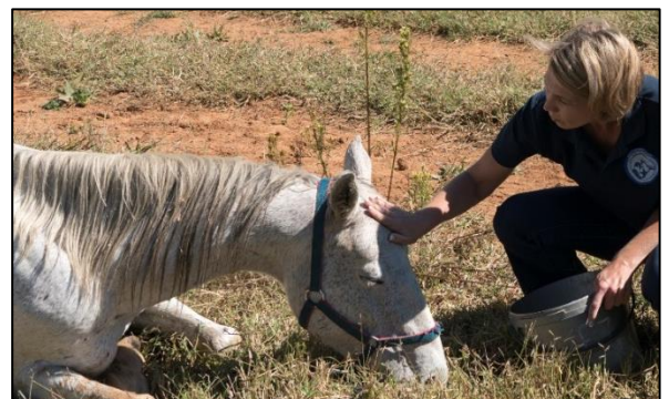
You can be there for wounded working animals by making a donation today

Can working animals depend on you? Your gift can provide emergency treatment for an animal with a serious wound and help communities to stop preventable wounds.