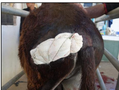
Jamil received expert care at SPANA's centre