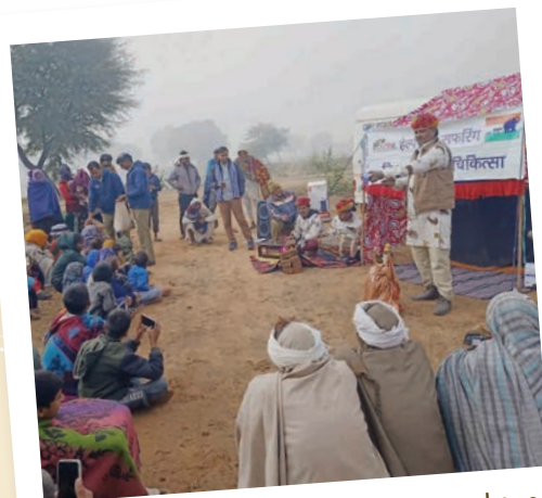
Community-based education can make a lasting difference for working camels.

In Jaipur and Bassi, our local partner, Help in Suffering, used an innovative and engaging approach to promote camel welfare – a puppet show designed to share animal care messages in a fun and accessible way. The show reached 34 people and was followed by a hands-on activity session, demonstrating how creative, community-based education can make a lasting difference for working camels.