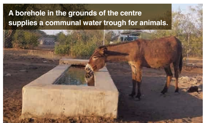
A borehole in the grounds of the centre supplies a communal water trough for animals.

Community workshops have also begun, providing owners with practical knowledge about nutrition, wound prevention and parasite control. These sessions are