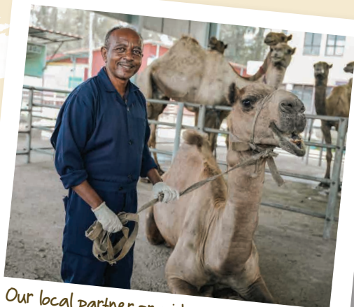
Our local partner provides vital veterinary treatment in some of the toughest conditions on Earth.

Our local partner has extended its work to help working camels in the remote salt pans of Afar. In this extremely arid and challenging region, the team is providing vital veterinary treatment and support and advice for owners. This work is improving the health and welfare of these hardworking animals who endure some of the toughest conditions on Earth.