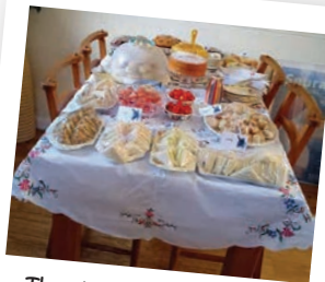
The delicious tea party.