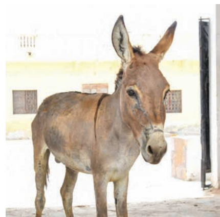
Eye conditions can cause debilitating pain and sight loss in working animals like Fyaz.

Think of the last time you had something stuck in your eye. A speck of dust, a stray eyelash, or a piece of grit on a windy day. The sting, the watering, the desperate urge to rub it away.