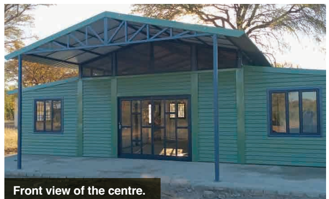
Front view of the centre.

Thoko was fortunate that our mobile veterinary team was in the area when she needed them. Now, with the new fixed centre opening, donkeys like her will have a place to rest and recover under veterinary supervision until they are truly well again.