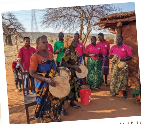
A Cultural Donkey Welfare Group highlight the importance of animal welfare through song.

In Mtera, our local partner, the Tanzania Animal Welfare Society, helped a Cultural Donkey Welfare Group create songs that highlight the importance of good animal welfare. The group performs these songs at community gatherings, advising people how caring for their donkeys leads to healthier, stronger animals.