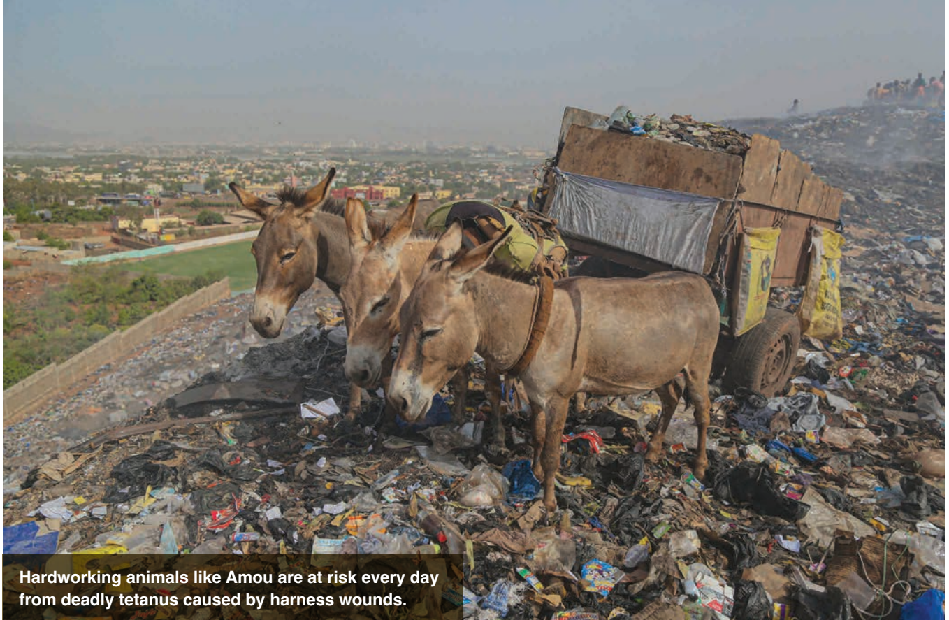
Hardworking animals like Amou are at risk every day from deadly tetanus caused by harness wounds.

flinched at the touch. They gently cleaned and treated his injury, applied soothing ointment and gave him pain relief to ease his suffering.