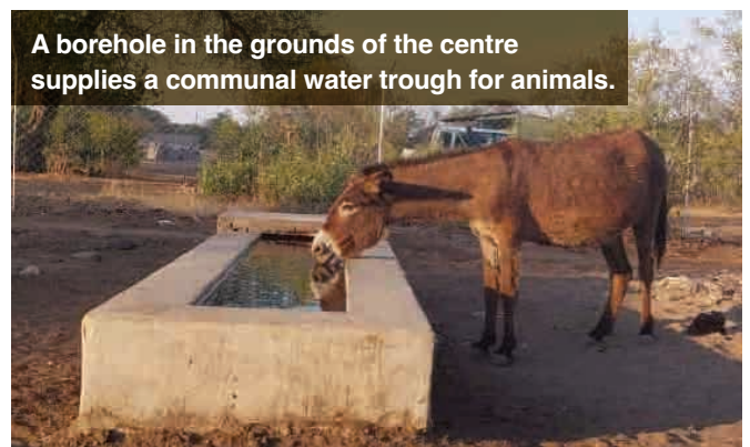
A borehole in the grounds of the centre supplies a communal water trough for animals.

Community workshops have also begun, providing owners with practical knowledge about nutrition, wound prevention and parasite control. These sessions are