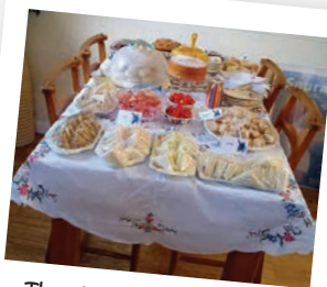
The delicious tea party.